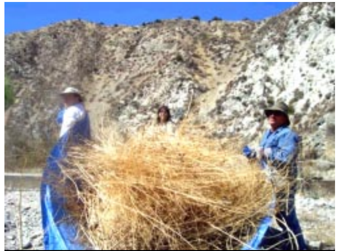
Habitat Works removing invasive plants