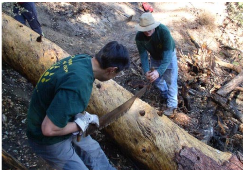
Bear Canyon Trail Crew removing a downed tree with a crosscut saw