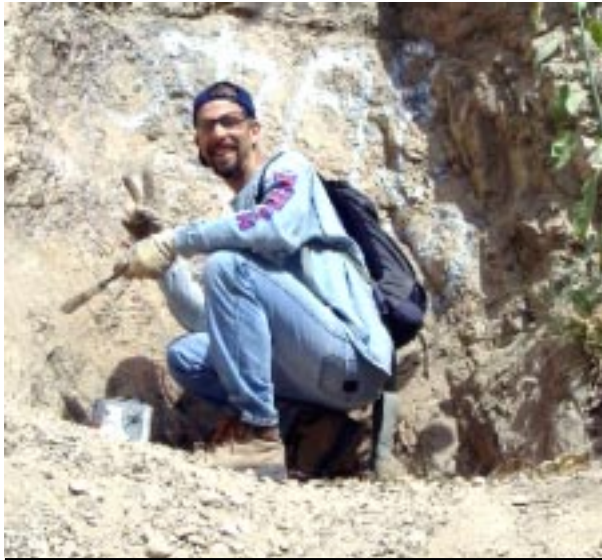
Blight Busters Trail Crew removing Graffiti

The Angeles may be closed for now to visitors, but there is still work to be done. Contact Howard on what needs to be done in the Angeles.