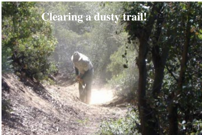
Clearing a dusty trail!

http://www.outdoorsclub.org/Pasttrip/PastTripDetail.asp?id=12394&leadername=Richard+Nyerges&area=1