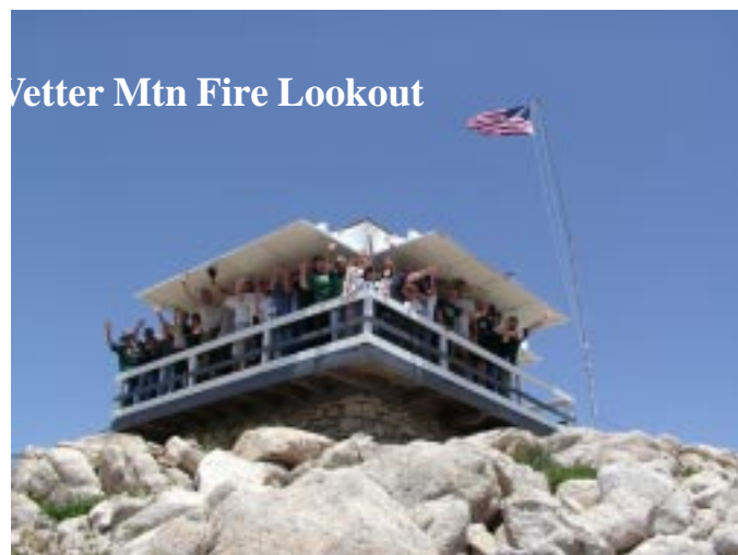
Vetter Mtn Fire Lookout