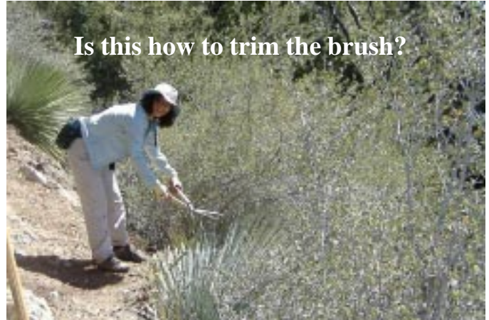
Is this how to trim the brush?

A special thank-you to the Mount Wilson Observatory Association (MWOA) for the tour of the guided tour of the Observatory .