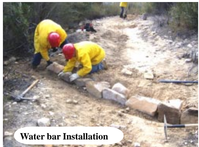
Water bar Installation

June 2nd - National Trails Day, Mt. Wilson