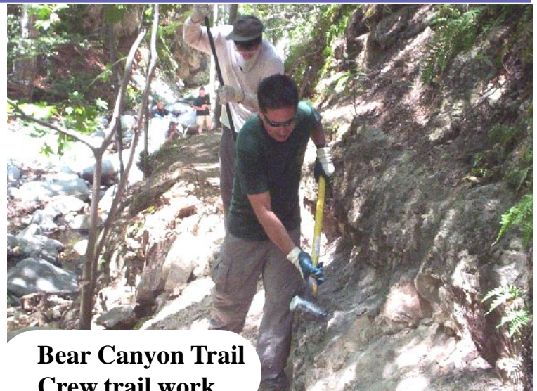
Bear Canyon Trail Crew trail work