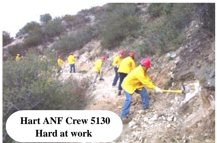
Hart ANF Crew 5130 Hard at work