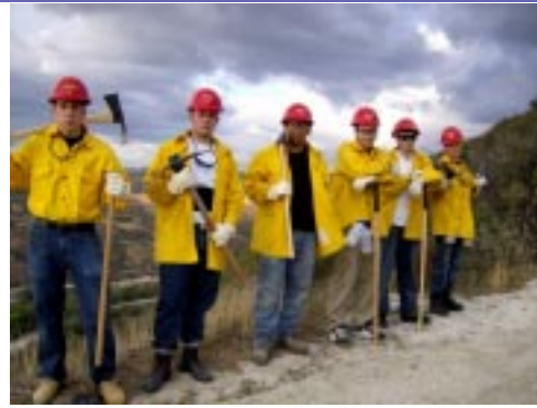
William S Hart UHSD of Santa Clarita ANF Crew 5130