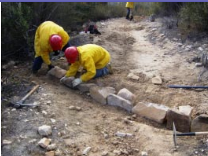
William S Hart UHSD Students Installing a Water Bar