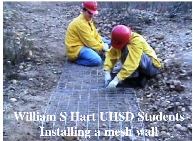
William S Hart UHSD Students Installing a mesh wall