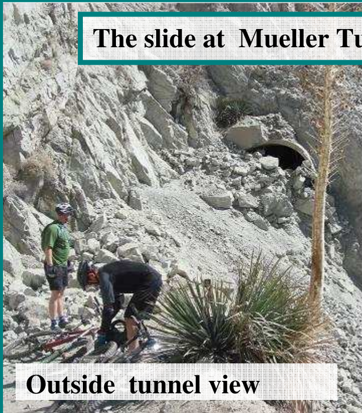
Outside tunnel view