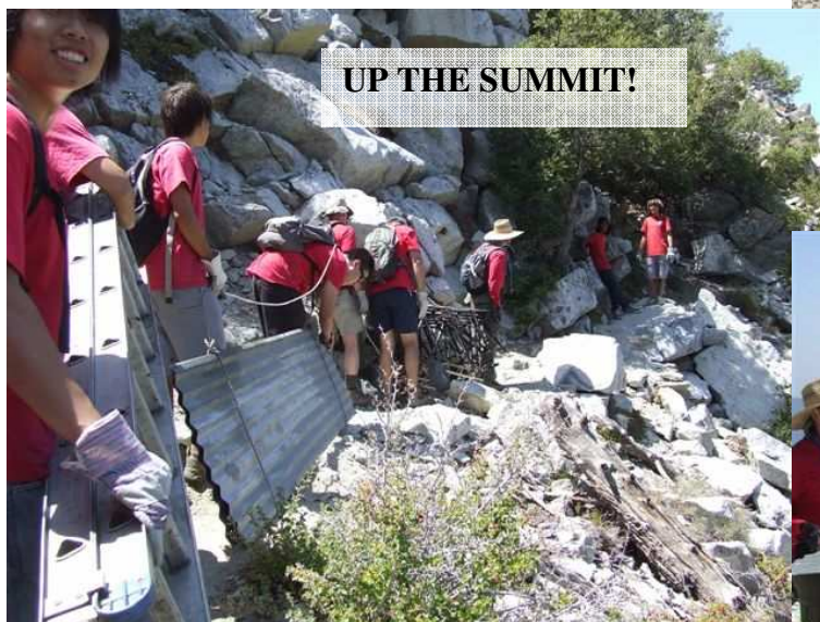
UP THE SUMMIT!