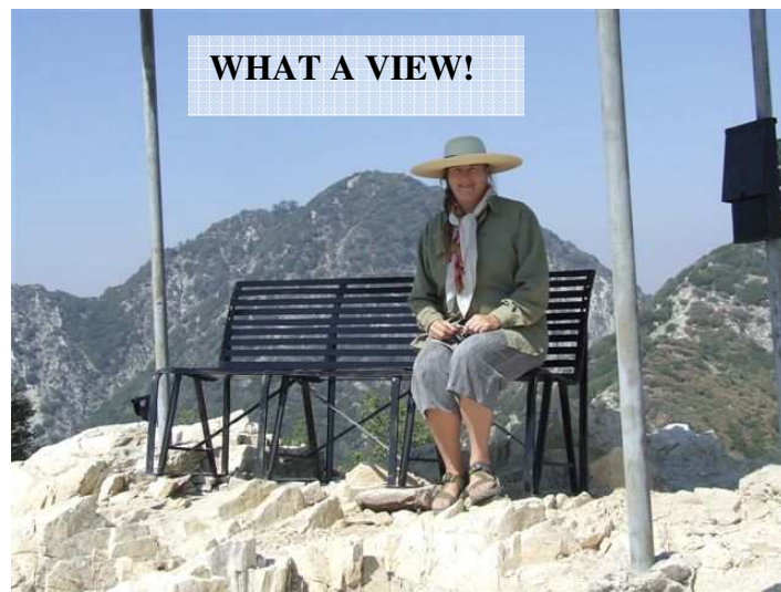
WHAT A VIEW!