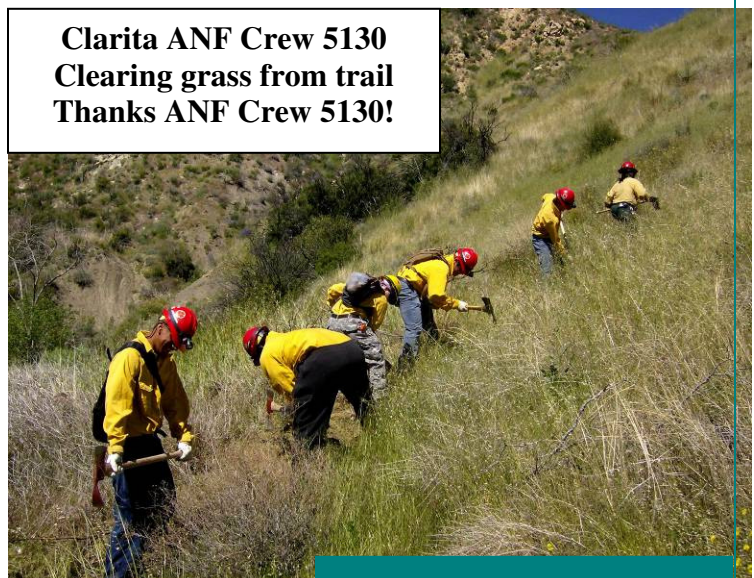
Clarita ANF Crew 5130 Clearing grass from trail Thanks ANF Crew 5130!