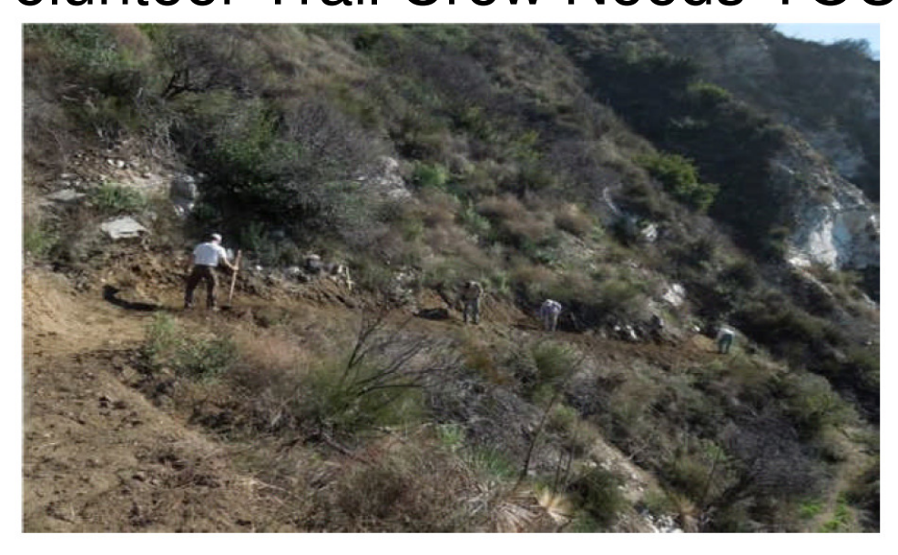
(Trail Restoration on Crescenta View Trail, December 2012)

Deukmejian Wilderness Park was heavily damaged from 2009 Station Fire. A Volunteer Trail Crew has been working on restoring the trails in the park. Restoration was complete on the Rim of the Valley Trail at the end of September 2012. Since then, the crew has been working on the Crescenta View Trail that leads to Mount Lukens.