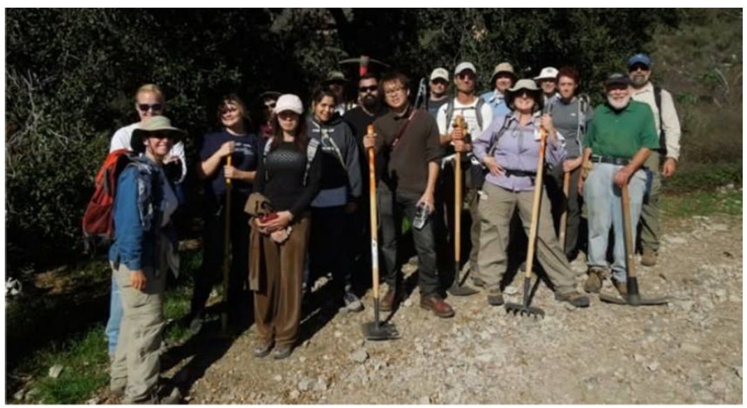
(Sierra Club Trail Restoration Event, December 2012)

We had a tremendous turn out for the Sierra Club Trail Restoration Event on Saturday, December 8, 2012 at Deukmejian Wilderness Park. We had several experienced Sierra Club members that worked with our crew to restore a really tricky section of the trail. Sierra Club Events are usually open to non-members as well, so we had several non-members attend, including a group of students from Mt. San Antonio College Geography Class. Along with our regular crew, we ended up with 24 total volunteers on Saturday. We covered about 1/4 mile of trail restoration on the Crescenta View Trail all together this week. The Crescenta View Trail starts in Deukmejian Wilderness Park and leads to Mount Lukens in Angeles National Forest. Awesome work!