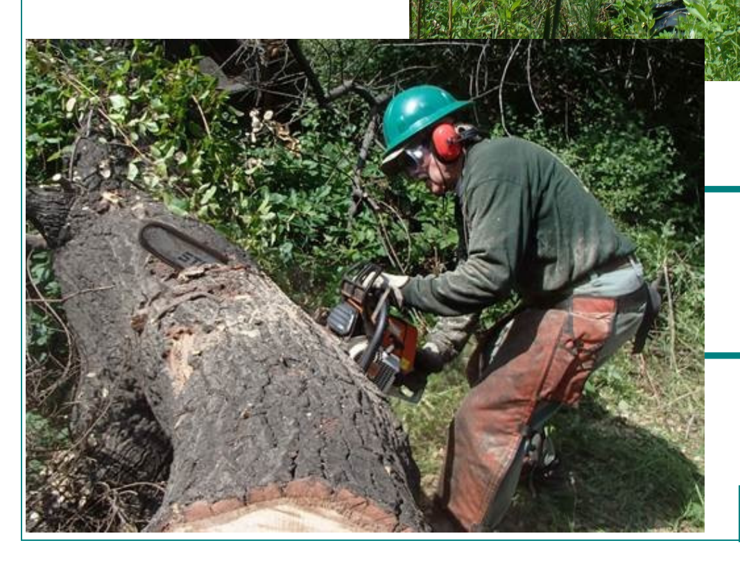
Volunteers doing Trail work on California Trails day.

Volunteer Hal removing a tree blocking a trail