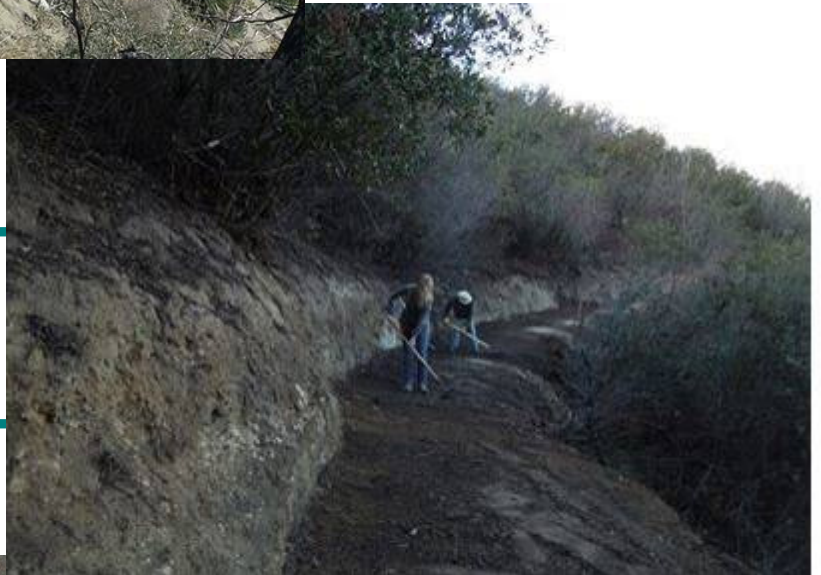
CV Trail Crew finishing up work on a trail.