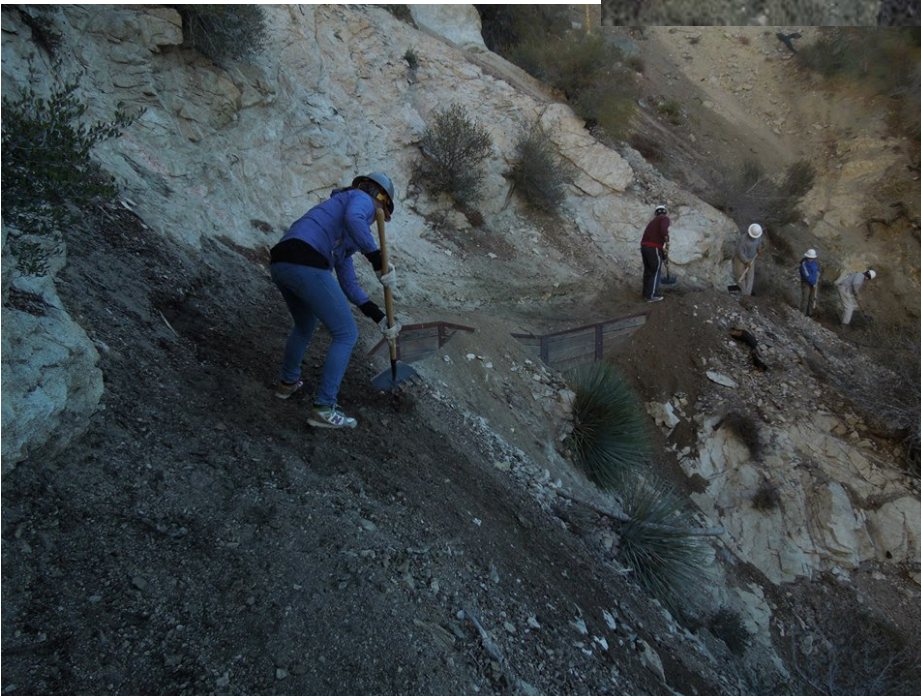
CV Trail Crew and Sierra Club clearing the trail to Strawberry Peak