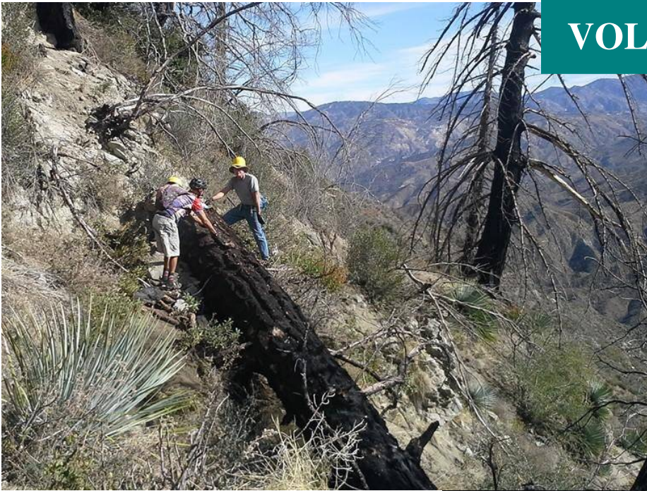
Angeles Mountain Bike Patrol Planning how to remove the fallen tree off the trail.