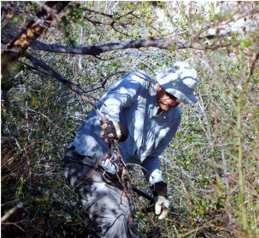
A volunteer working on the brush at George's Gap

Can never be too young to learn trailwork