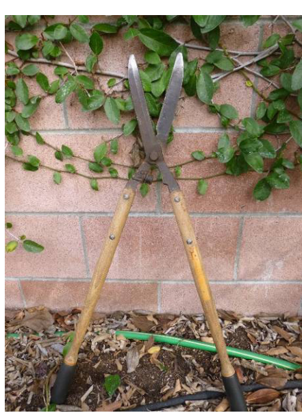
Long handle hedge shears. Ideal tool for poison oak and soft branches.