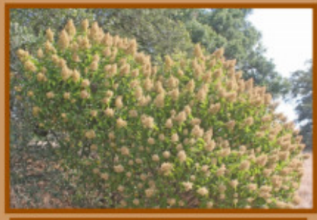
Laurel sumac (Malosma laurina)

Join us for a hike through the Park as we try to answer these questions and more. The hike will take place on moderately steep trails (Mummy Rock Trail, Vineyard Trail). There will be a number of stops to identify plants and discuss the impacts of man, fire, and climate on the native plant communities.