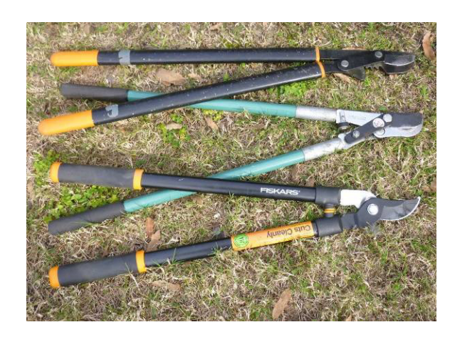
Bypass loppers. Simple (bottom), compound lever-action (center), compound gear-action (top)

For pruning poison oak and plants with many small branches, long handle hedge shears work very well.