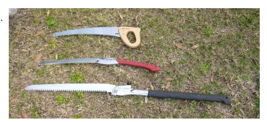
Japanese style pruning saws made by Corona (top) and Silky (bottom 2). The Japanese made saws are among the best available but the Corona is effective and cost much less.

It is strongly recommended to avoid low cost or store brand pruning tools. Rarely does the cost savings recover itself especially when the tool breaks after a few outings.