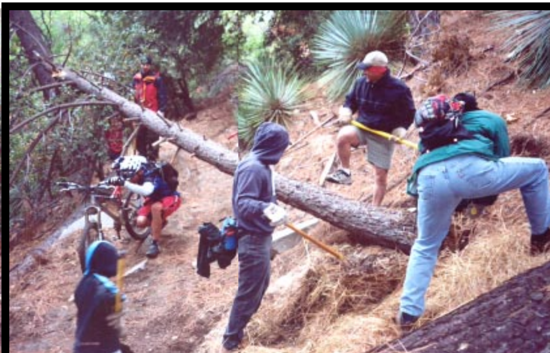
Angeles Mountain Bike Patrol clearing a bike path of a tree